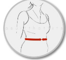
5. Exact waist