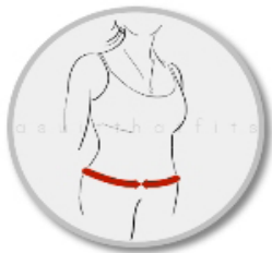
6. Low waist