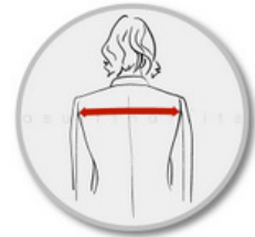
10 Back chest