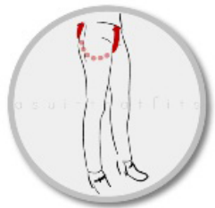
17. Full crotch