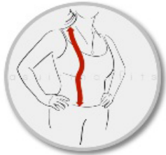
16. Shoulder to front waist