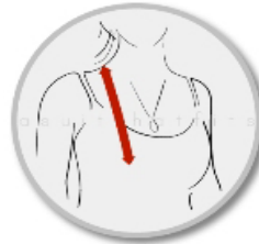
12. Shoulder to bust