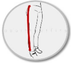
22. Pants length

Age: ..... Height: .....cm Weight: ..... Photo from 3 portions with whole body (Front, Back and side)