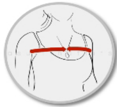
9. Front chest