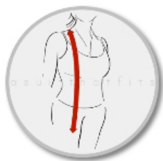
15. Length for Jacket or Blouse