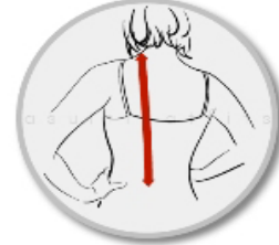
13. Shoulder to Back waist