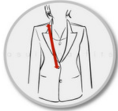
14. Shoulder to first button