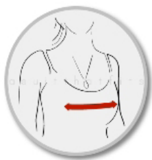
11. Bust to bust