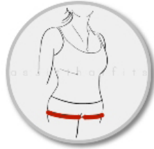
8. Hips (Lower part)