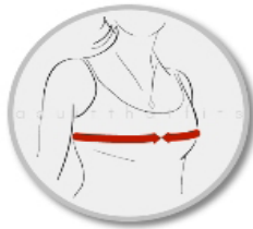
3. Full chest